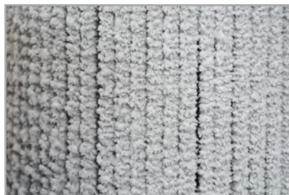
filter cartridge in use