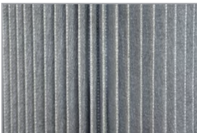
new filter cartridge

TBH standard filter cartridges feature a microfibre surface made of PES (polyester) and a conductive coating. They are tough and well-protected against mechanical damage, and they represent a solution for a wide range of customer applications. For special applications, PTFe-coated filter cartridges and other accessories are also available.